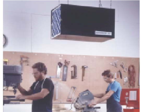
The M67 cleans wood particles and dust from wood shops.