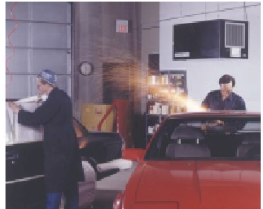
The M67 is perfect for auto body shops.